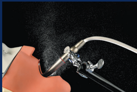
Contra-angle w/ spray air