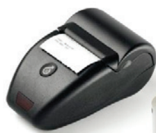
Bar Code Printer