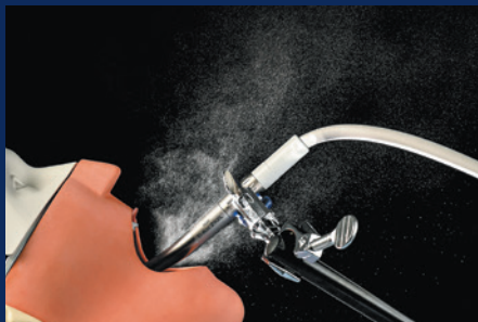
Air Turbine w/ spray air